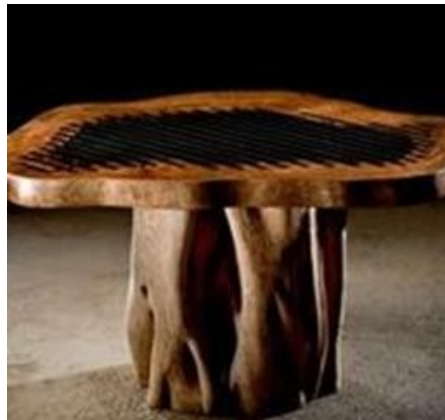
India tree bases come in dining and coffee table heights