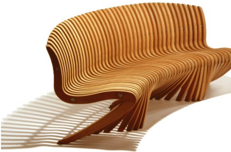
Curved Spirit Song Bench