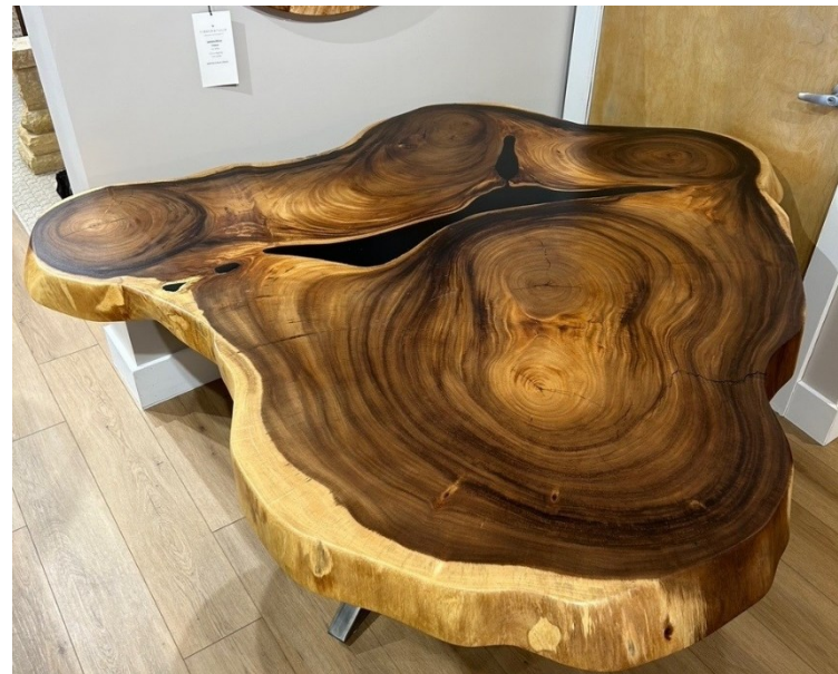
Nice Monkeypod Crosscut from Diamond Tropical Hardwoods