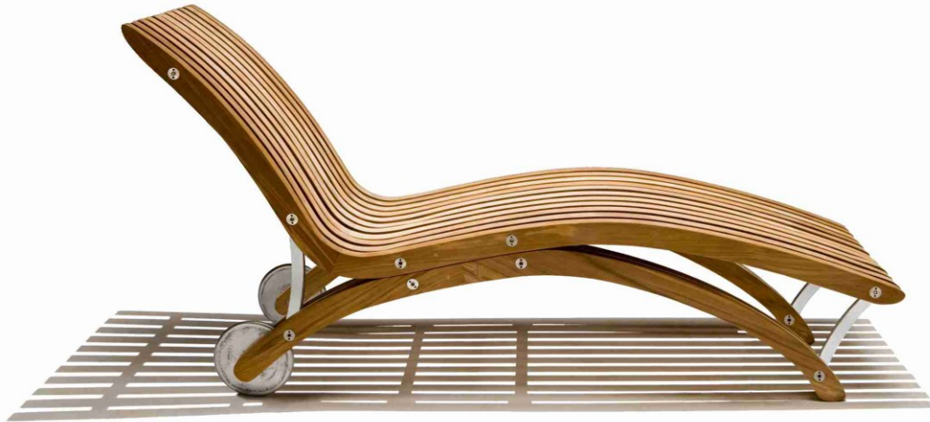
Spirit Song Chaise Lounge