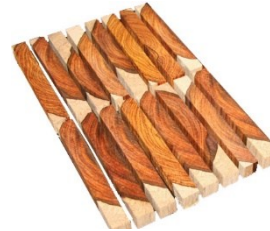
Pen blanks with some white wood

* Larger dimensions available. Other lengths available in 1.5" x 1.5", and 2" x 2"