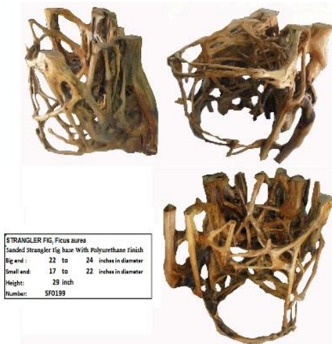
Strangler fig bases come in dining and coffee table heights

Many other exotic tropical hardwoods available. Please contact us with you inquiries. Longer, wider, and thicker wood available We custom saw, kiln dry, and finish (plane, sand, T&G, etc.)