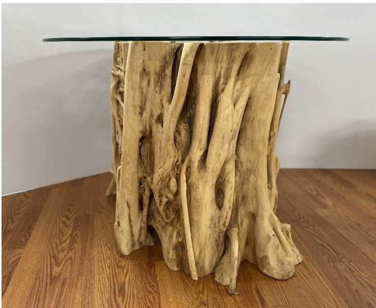
Strangler Fig Base with Tempered Glass Top