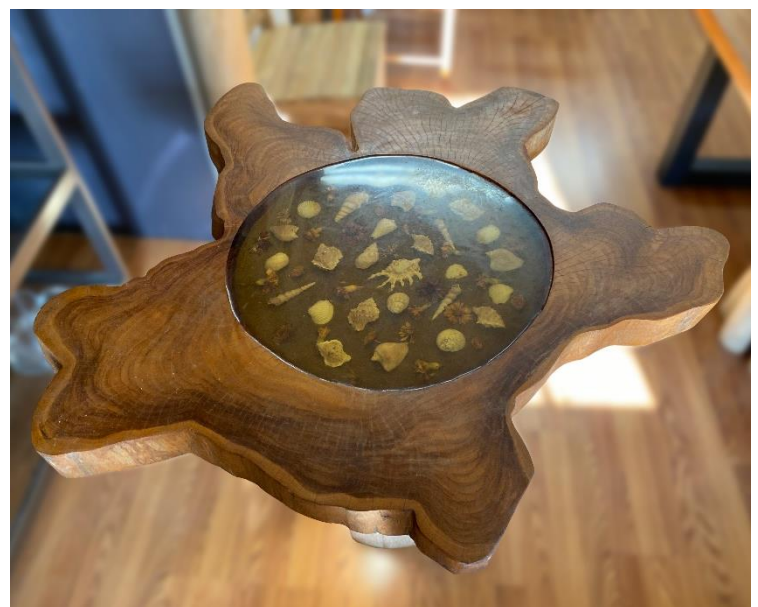
Jerry Livingston Teak Crosscut with Epoxy