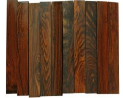
Cocobolo King Pen Blanks