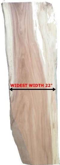
Monkeypod Slab #3038 Length 81 Inches