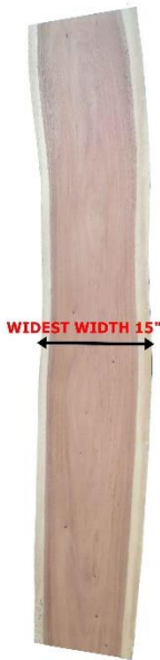
Monkeypod Slab #3025 Length 86 Inches