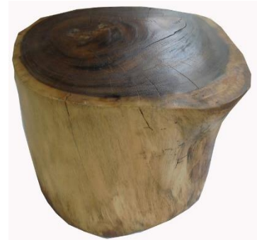
Monkeypod Bases #PM0017 Height 16 Inches