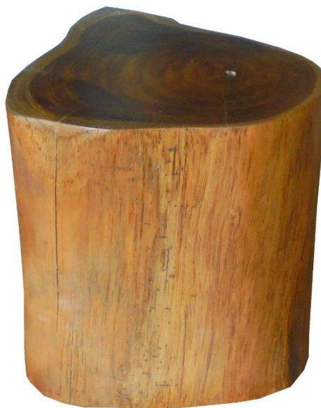
Poly Finished Teak Base T2347 Height 11 Inches