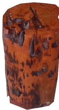
Goncalo Alves #GA7001 Height 18 Inches