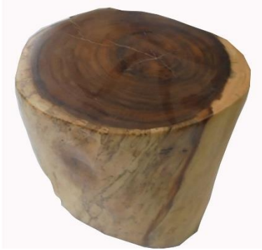
Monkeypod Bases #PM0013 Height 22 Inches