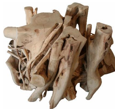
India Tree Bases #47 Height 24 Inches