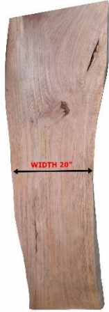
Mango Slab #2814 Length 67 Inches