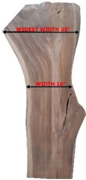
Teak Slab #2298 Length 55 Inches