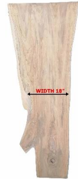
Mango Slab #2822 Length 63 Inches

*Pricing and available subject to change without notice