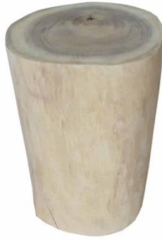
Monkeypod Bases #MP5027 Height 22 Inches