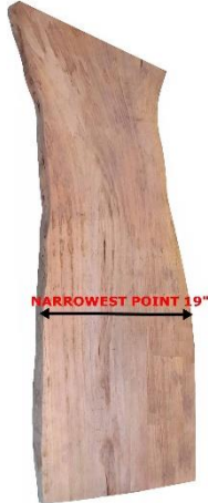
Mango Slab #2855 Length 67 Inches