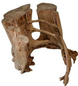
Strangler Fig #SF0115 Height 25 Inches