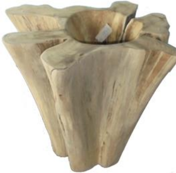
Teak Base #T0169 Height 26 Inches