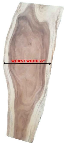
Monkeypod Slab #3006 Length 73 Inches