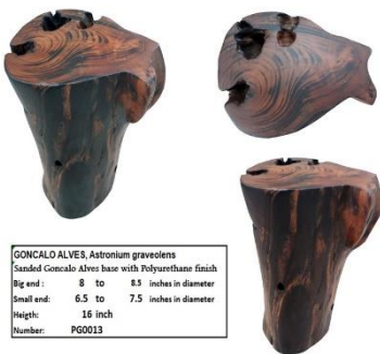
Goncalo Alves #PG0013 Height 16 Inches