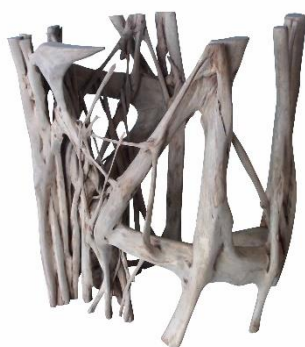
Strangler Fig #SF3157 Height 29 Inches