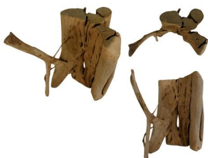
India Tree Bases #22 Height 26 Inches