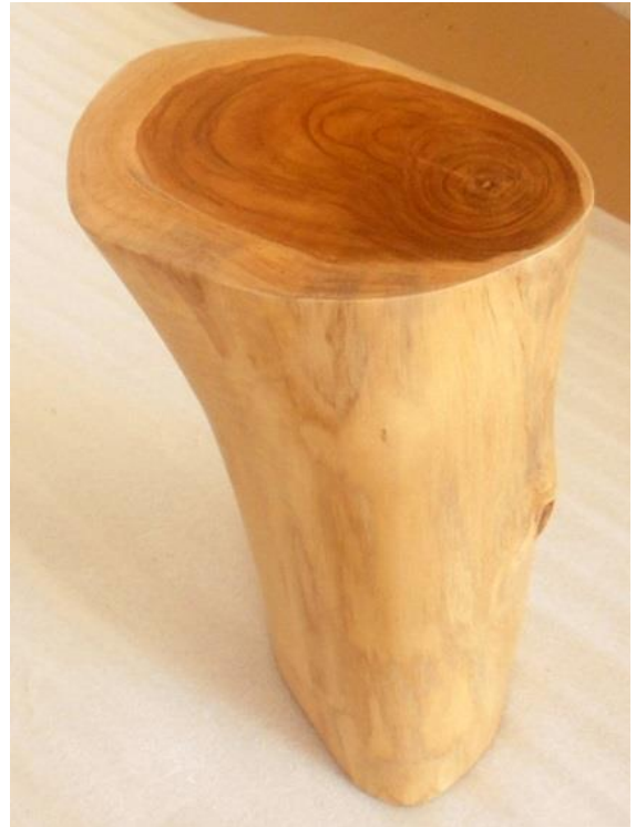
Teak Base #865 Height 18 Inches