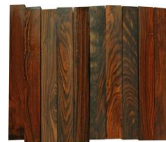
Cocobolo King Pen Blanks