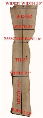
Mango Slab #1332 Length 131 Inches