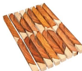
Pen blanks with some white wood

* Larger dimensions available. Other lengths available in 1.5" x 1.5", and 2" x 2"