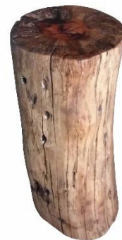
Goncalo Alves #GA7009 Height 23 Inches