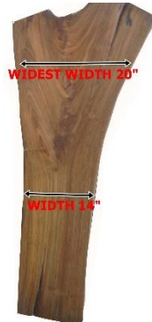
Teak Slab #1664 Oil Watco Length 60 Inches