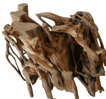
India Tree Bases #49 Height 22 Inches