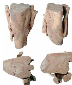
Strangler Fig #SF3154 Height 23 Inches